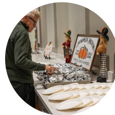
Funded a hospitality area for the renovated Friendship Hall at Mission Campus