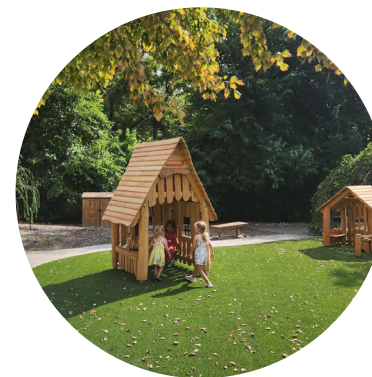
Added improvements to the Preschool playgrounds at Mission and Antioch