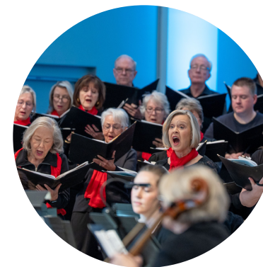
Funded Tidings of Joy at Mission Campus and the Messiah Sing-Along at Antioch Campus