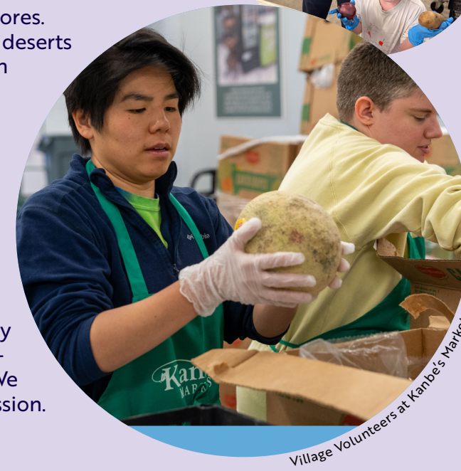
Village Volunteers at Kanbe's Markets