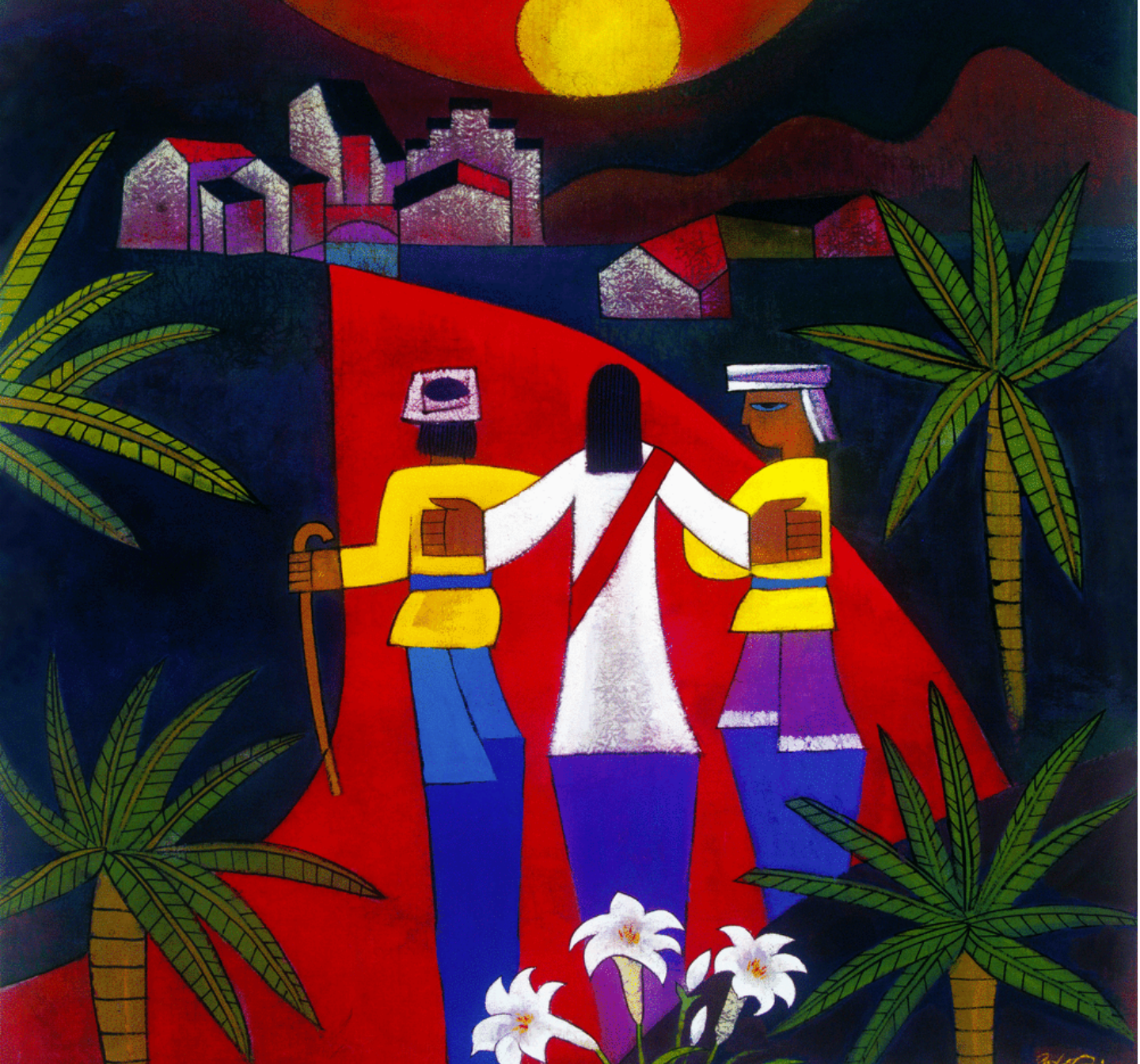
"The Road to Emmaus" (1997), He Qi