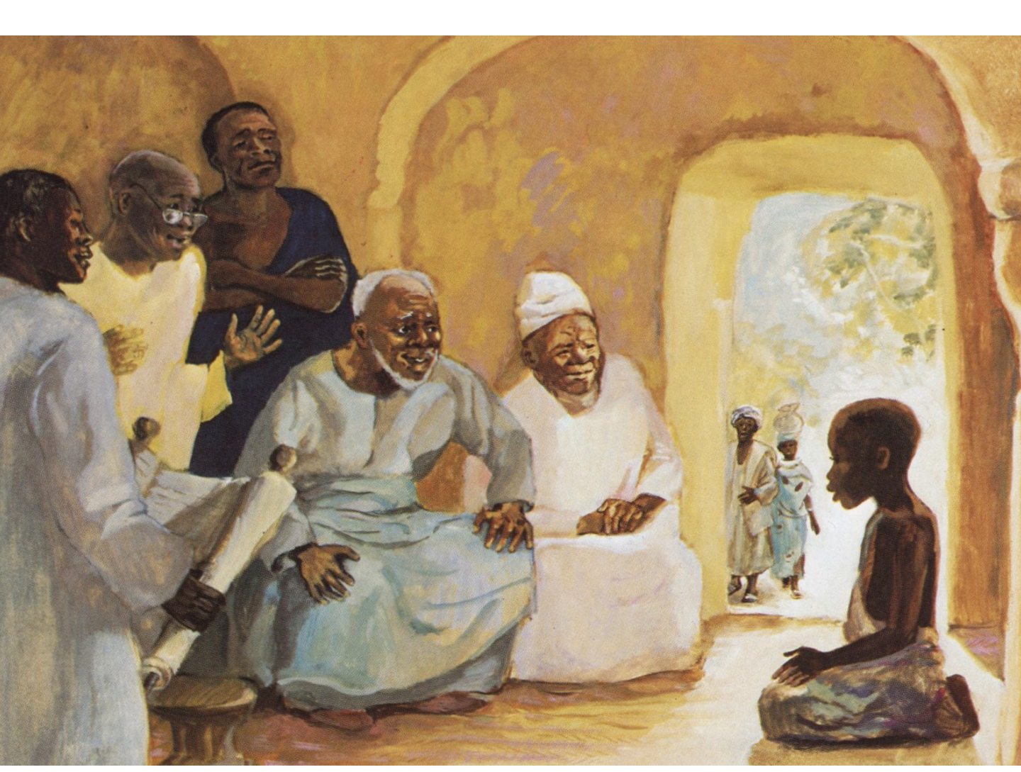
"Jesus Among the Teachers," Jesus Mafa, 1973, Cameroon