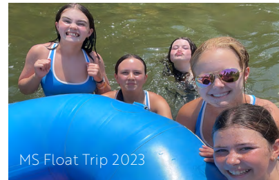
MS Float Trip 2023

We're thrilled to welcome back our joint mission trip! Join us as we team up with the Seattle community for impactful service projects and volunteer activities. We'll stay at a church, enjoy engaging programming, inspiring worship, and so much more. Don't miss out on this exciting opportunity to make a difference and have a blast together!