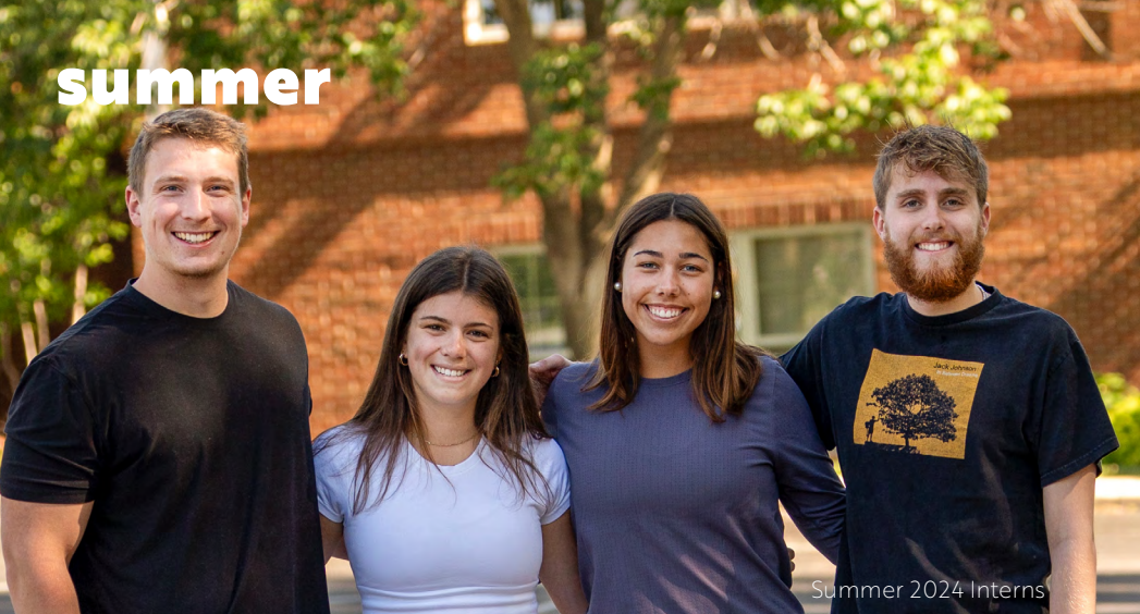
Summer 2024 Interns