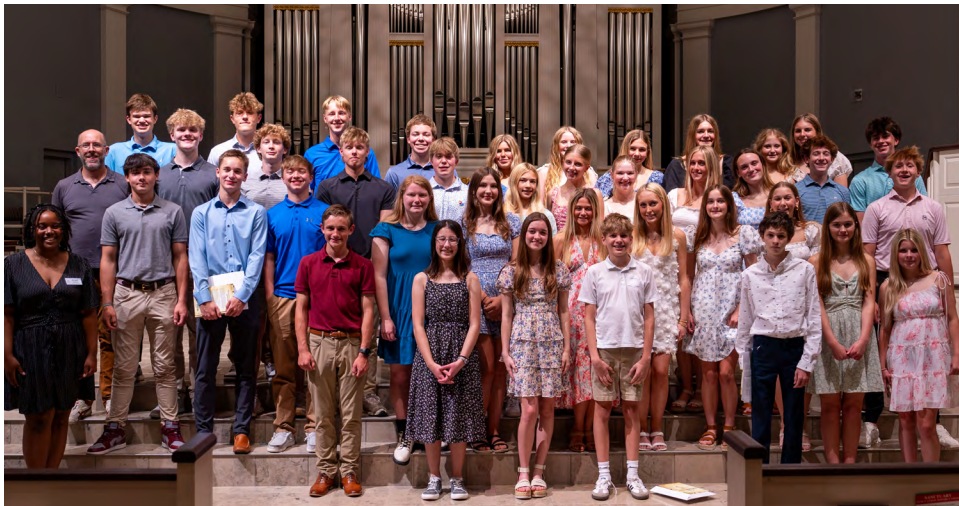
Confirmation Sunday 2024

Various Sundays Sept. - Feb. • 11 a.m. - 1 p.m. Youth Loft